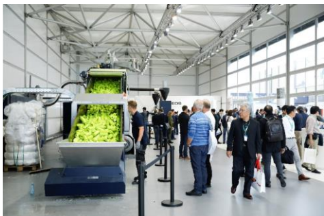
Visitors to the Circonomic Centre were able to experience live plastics recycling every day.